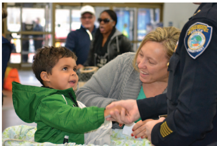
In Citrus Heights, CA, the Police Department and crime victim advocates hold Family Awareness Nights at local apartment complexes, to meet with community members and share information about domestic violence.

of domestic violence. Among those departments, victim advocates provide the follow-up in 82 percent of departments; detectives follow up in 79 percent of the departments; and responding officers in 38 percent of departments.