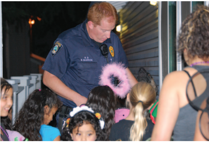
Domestic violence awareness event in Citrus Heights, CA

Police Department forwards reports to the Office for Women, which alerts the school that a child has been involved in a domestic violence incident, and may misbehave or need special consideration due to family problems.